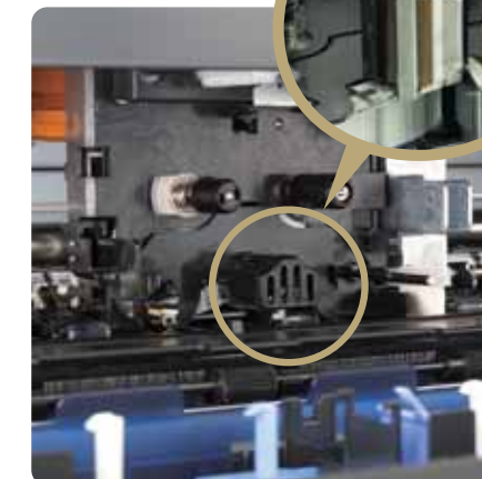
High resolution thermal imaging unit