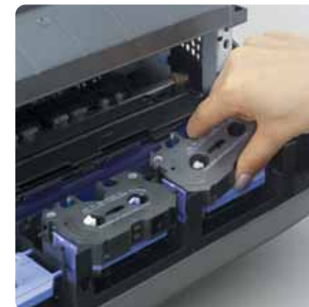
Easy and clean cartridge change