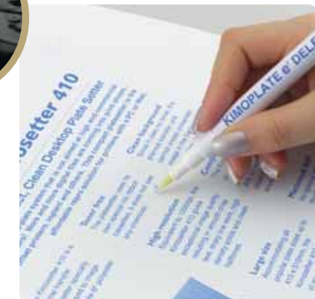
Unwanted image on Kimoplate e 2 can be removed easily using the deletion pen