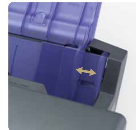
Selecting the plate guide position for portrait or landscape format plates